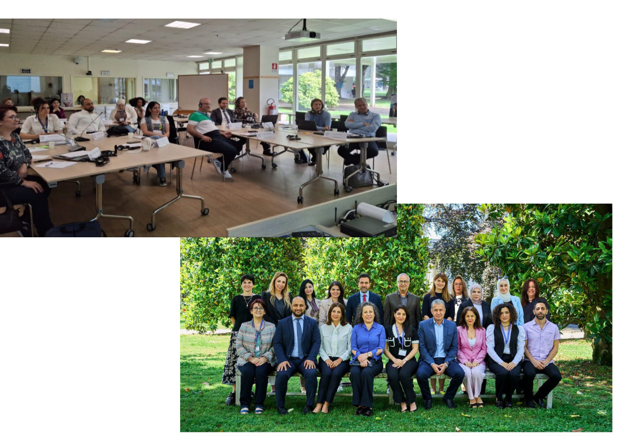
Training Program on Procurement Policy and Capacity Building for Lebanese Procurement Experts

Activity 1.5: 17 procurement and learning experts and trainers participated to a tailor-made Training Program on Procurement Policy and Capacity Building for Lebanese Procurement Experts, designed in collaboration with the ITC-ILO in Turin, in the aim to inspire transformational change and policy reforms in Lebanon.